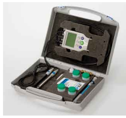
Field Compact Case