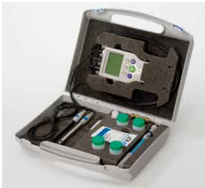
Field Compact Case